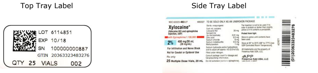
Figure 3: Permanent solution 2 for Unit-of-Sale Greater than 1.